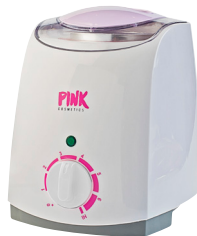
PINK PROFESSIONAL WAX HEATER 800 ML