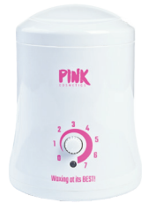
PINK PROFESSIONAL WAX HEATER 200 ML