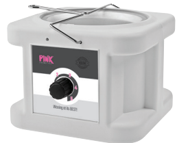
PINK PROFESSIONAL WAX HEATER 1000 ML