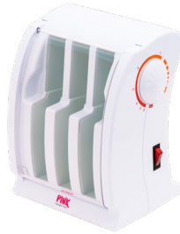
PINK PROFESSIONAL TRIPLE ROLL-ON WAX HEATER