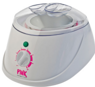
PINK PROFESSIONAL WAX HEATER 450 ML